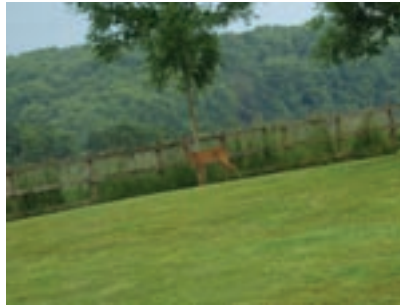
Deer ambles off through fence into meadow...