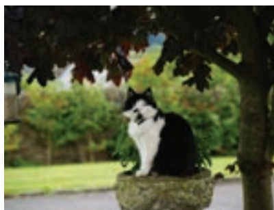
You really don't want to see what happened next! So here's a pic of 'emmy' our cat instead.

'Country life, red in tooth and claw. The fox isn't spitting feathers, the squirrel is no more'