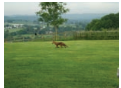
Fox appears determinedly looking for breakfast...