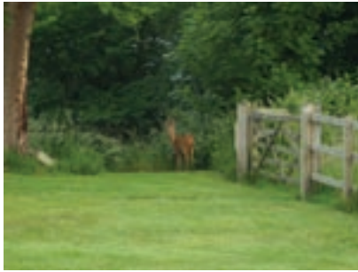
I peer out of the window to see a deer on the lawn...