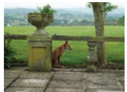
Sits down to wait...