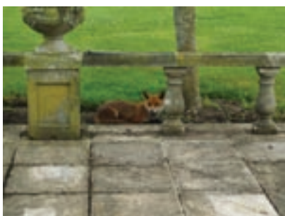
Lies down to wait...