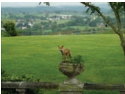
Fox comes towards house...